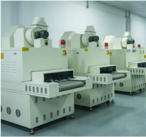
UV light machine