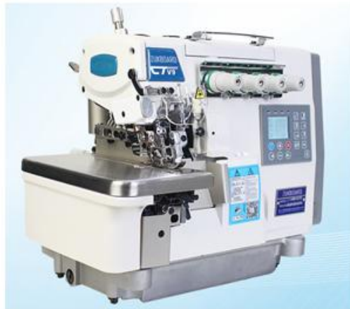
automatic welting machine