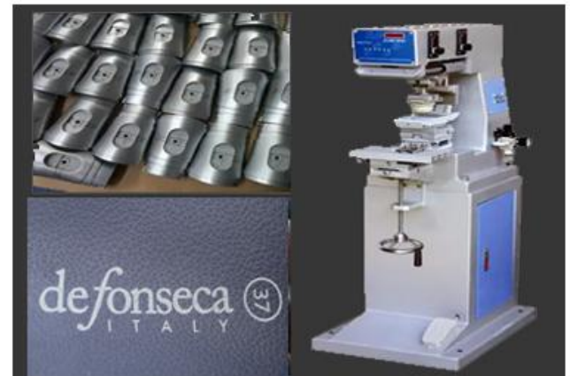
Pad Printing Machine