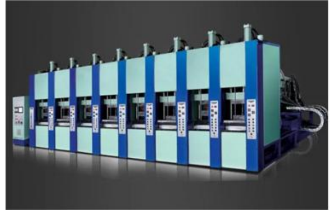
EVA injection machine